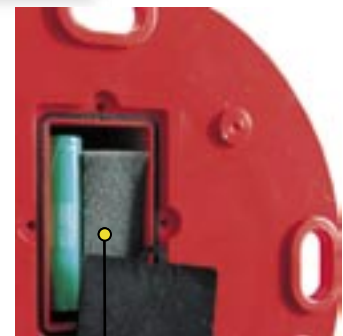
Battery access via sealed compartment