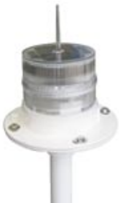
AV60 with optional mounting plate.

Coupled with LED technology, and a highly efficient DC/DC converter, the light may provide over 25 days of continuous operation without sunlight. The AV60 comes with a large 200mm OD base pattern, and is available with voltage-free contact for remote monitoring.