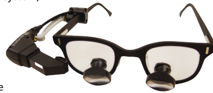
MD-6 Critical Data Viewer (Surgical loupes not included.)

Working in conjunction with your current patient-monitoring system, MicroOptical's MD-6 Critical Data Viewer displays vital signs where you need them most — right before your eyes. Without obstructing your natural field of vision, the viewer duplicates the live display of your monitor as a floating image positioned a few feet in front of you — displaying vitals in real-time. By keeping both patient and critical data in your hand-eye axis, the viewer allows you to view vital signs repeatedly without having to look away at a monitor. By connecting to two VGA sources, surgeons can view two sets of critical data, such as vital signs and cath lab images, and alternate between them. Compact, lightweight and comfortable, it easily attaches to surgical or prescription eyewear. Experience patient monitoring at the next level with the Surgical Data Viewer System from MicroOptical.