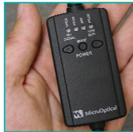
Belt-Worn Controls/Battery Dimensions: 3" x 2" x 0.5"